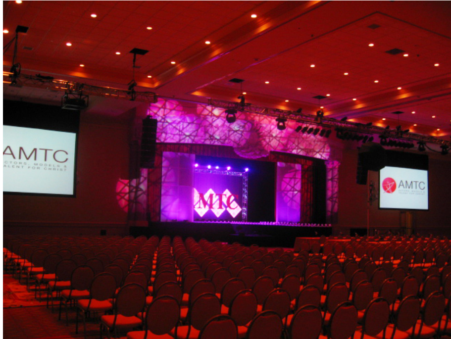
The AMTC Summer 2010 held at the Gaylord Palms in July 2010 - Orlando, FL