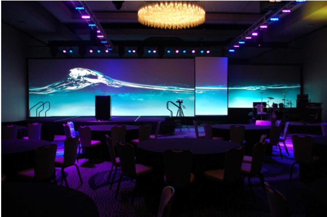
Swank Audio Visuals' Annual National Leadership Meeting with Analog Way's systems

Swank Audio Visuals is an international technology service provider, partnering with more than 375 four-five star resorts and hotels in 165 major locations. Swank Audio Visuals relies upon 75 years of experience and a large team of dedicated technology specialists to accommodate everything from intimate gatherings to large conventions.